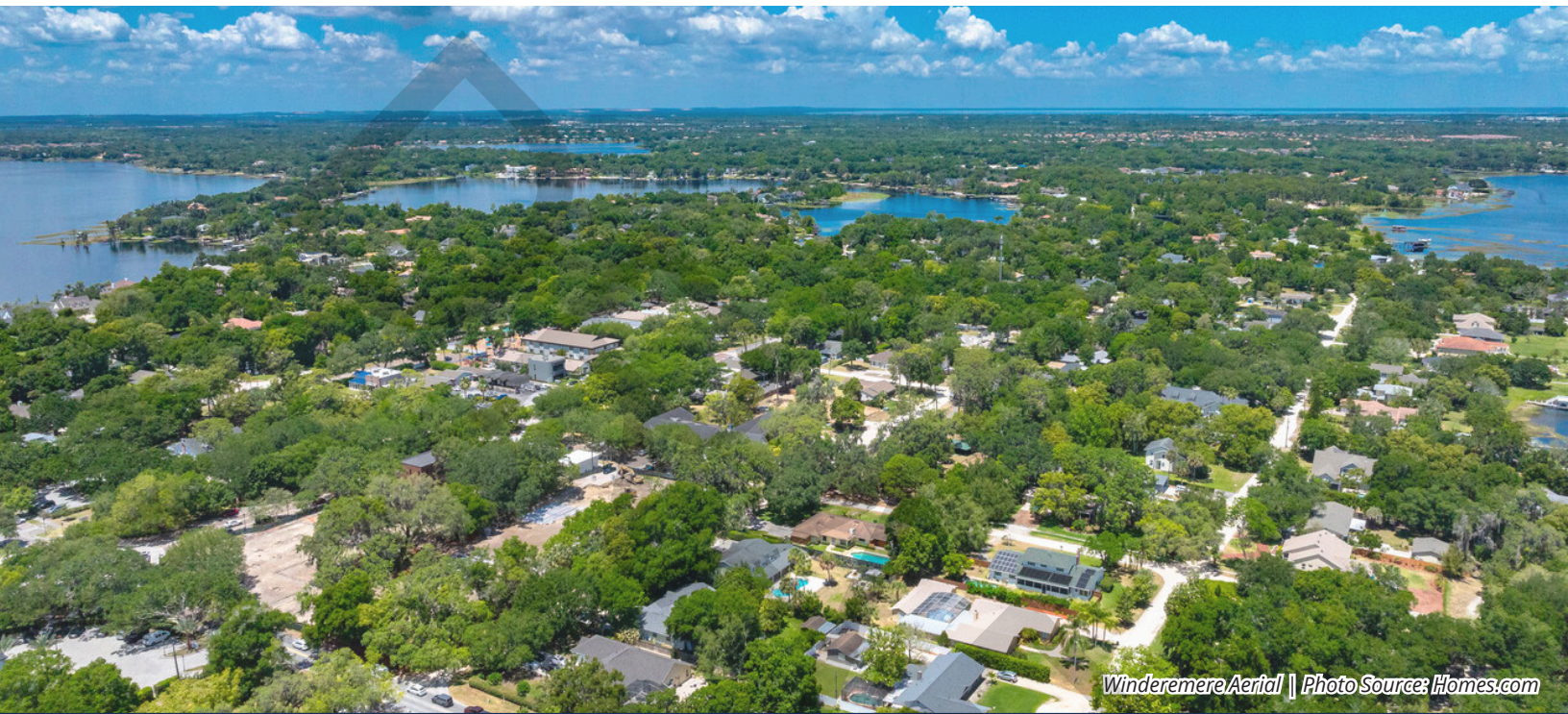
Winderemere/Aerial | Photo Source: Homes.com

To advocate for the proper allocation of resources in technology, environment, and infrastructure through proactive strategic planning embracing the Town’s unique culture and community life.