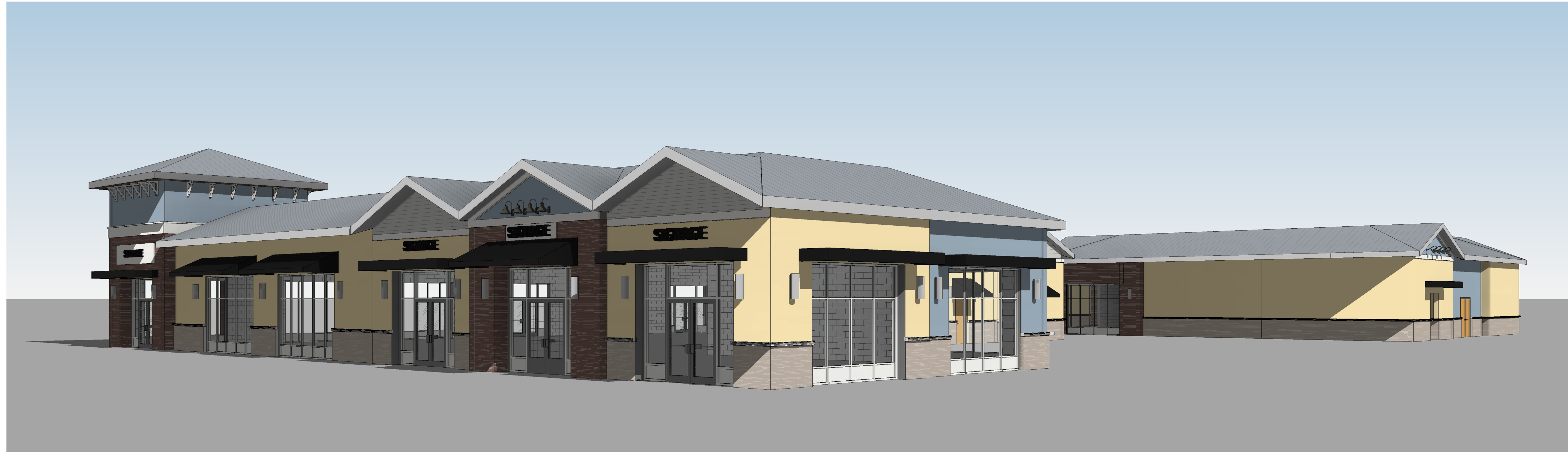
EAST CORNER 3D VIEW