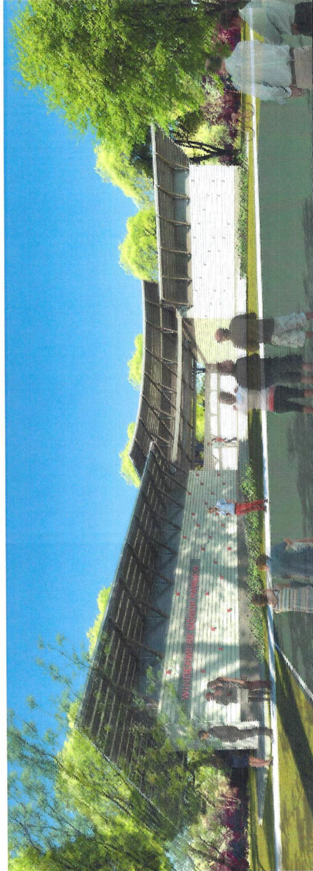
3D VIEW - OPTION 2